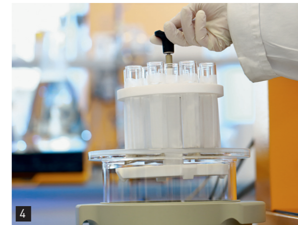
The removable handle makes it easier to insert and remove the sample carousel.