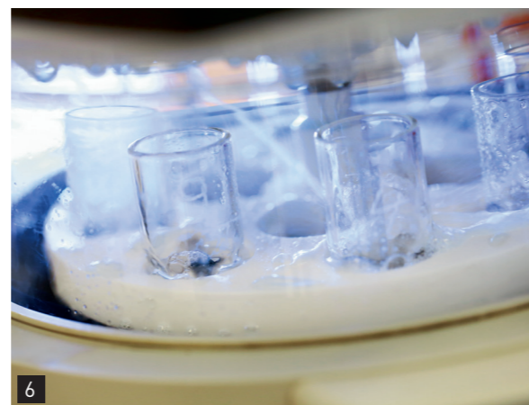
The rotating sample carousel ensures optimum bathing of the sample. The rotation is generated by the jet of detergent.