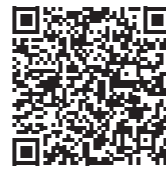
Scan the QR code and watch our FIBRE THERM video.

“FIBRE THERM standardises fibre analysis in feedstuffs, reaching a new level of quality, making it more economical, more precise and more reliable.”