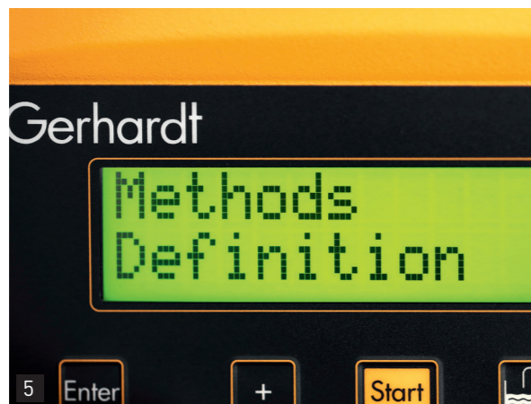
9 different methods can be freely configured and saved.