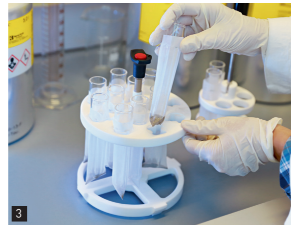
When the FibreBags are inserted into the sample carousel, they are automatically clamped firmly in place.