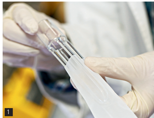
Easy handling: Insert FibreBag, weigh sample and you're ready. No need to seal the filter bag.