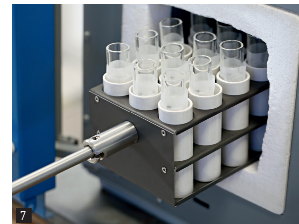
The incinerating module with a long handle makes handling of samples easier.