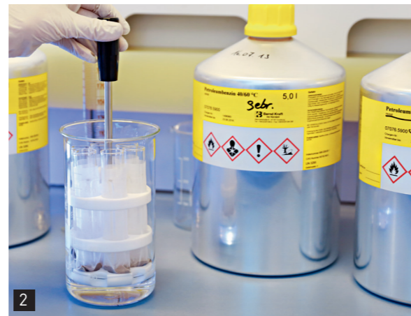
Convenient, time-saving degreasing with solvents in the degreasing module. 6 samples can be treated at the same time.